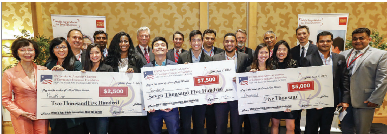
▲ Discovering the Next Generation of Innovative Entrepreneurs: For the third year in a row, USPAACC provided a platform for startups in the instant-hit "What's Your Pitch: Innovations Meet the Market" national competition. Eight (8) businesses from across the country pitched their innovations to a panel of judges composed of investors and corporate procurement executives to compete for cash prizes and opportunities to meet one-on-one with the judges to promote, market or receive a hand up.