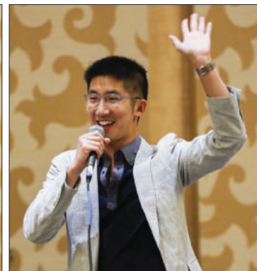
▲ Founders of LEEDING MEDIA, REDOCTANE, CATALYTE, and KIIP share their experiences and insights into their game-changing business models.