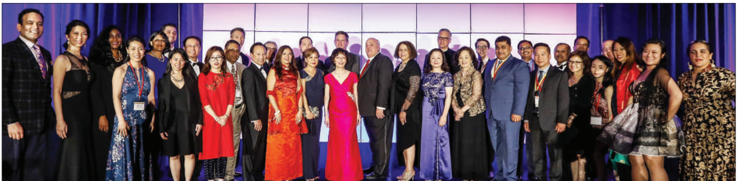
▲ IT TAKES A VILLAGE TO HOST A NATIONAL CONFERENCE: The USPAACC Team with Conference Co-Chairs, Brain Trust Members, Board Members, Sponsors and more.