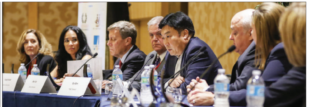
▲ HIGH-LEVEL NETWORKING (From left): Suppliers connect with CPOs of Fortune corporations following the CPO Forum; The esteemed panel share their industry insights to a capacity audience hungry for precious information and opportunities, and best practices at the CTO/CIO Forum.