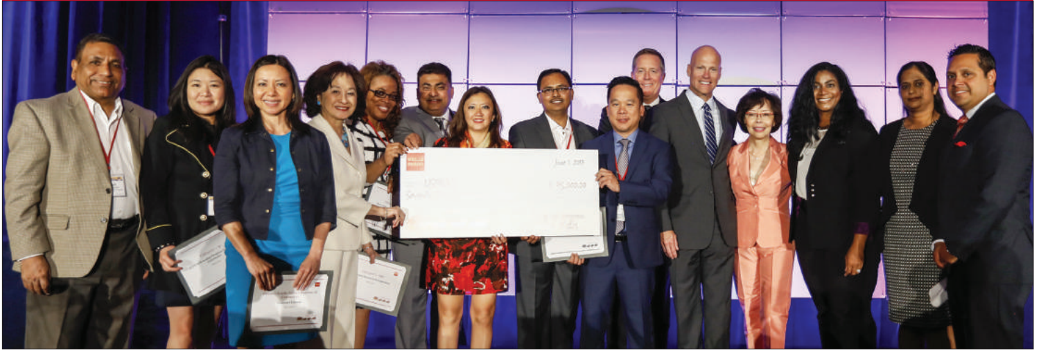
▲ Micro-Grant Recipients: 5 Asian American Chambers from across the country were awarded the Wells Fargo micro-grant to build capacity and expand their existing programs.