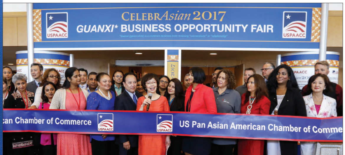
At the CelebrAsian Procurement Conference 2017 ribbon-cutting ceremony: An auspicious tradition with corporate and Asian American co-chairs and sponsors, to officially open the Guanxi* Business Opportunity Fair and USPAACC's signature one-on-one business matchmaking meetings on June 2, 2017 in San Diego, California. *A common business term meaning “connections” or “relationship.”