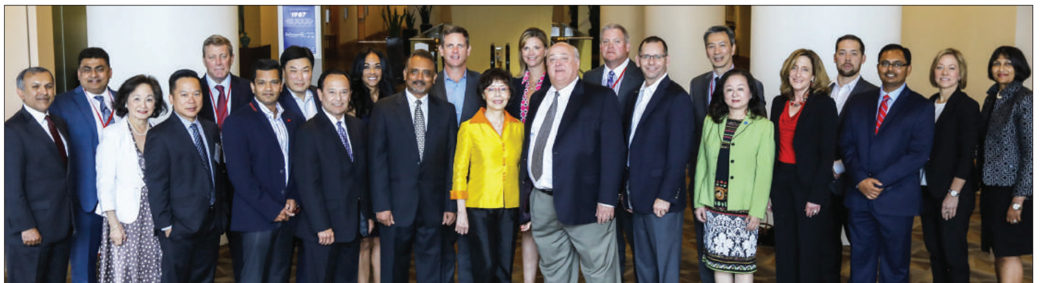
▲ CPO FORUM: Distinguished panelists from Fortune powerhouses gathered at the CPO Forum and talked about the procurement landscape, their needs and requirements, and opportunities available to small and minority businesses in the local and global supply chain.