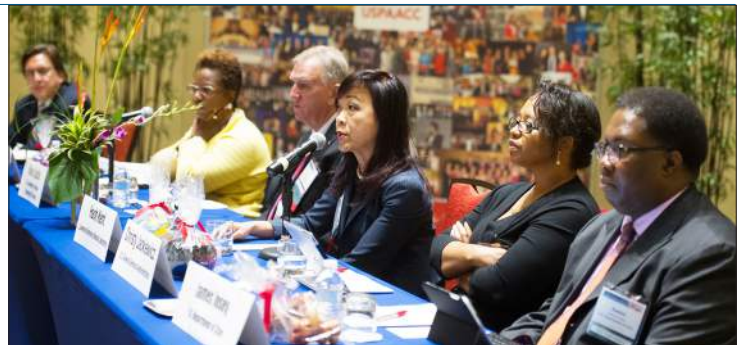
Government panel lays out federal contracting opportunities for minority suppliers.