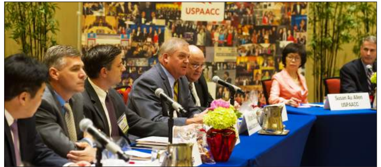
Thirteen top-level procurement officers from Fortune powerhouses discuss domestic and global trends in the supply chain.