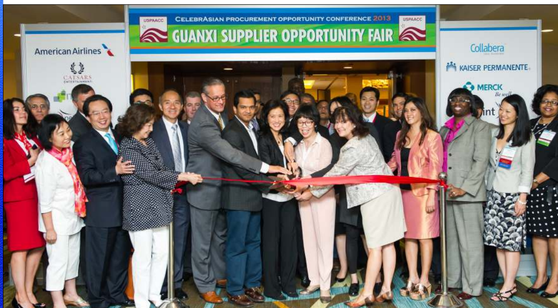
Creating an auspicious start: At CelebrAsian 2013 ribbon-cutting ceremony to officially open the Supplier Trade Fair and USPAACC's signature pre-scheduled one-on-one procurement matchmaking sessions on June 5, 2013 in Garden Grove, California.