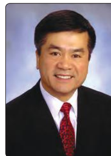
The Honorable Gary Locke Secretary of Commerce