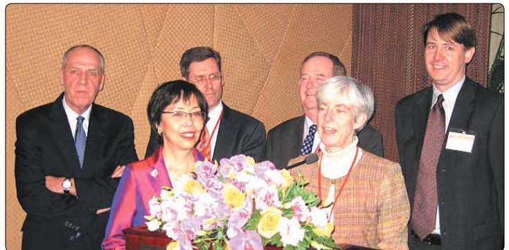
U.S. Consul General Beatrice Camp (Shanghai) addresses the China Trade Mission participants