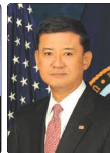
The Honorable Eric Shinseki Secretary of Veterans Affairs