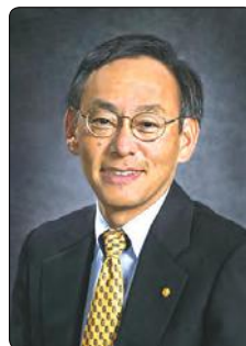
The Honorable Steven Chu Secretary of Energy

USPAACC Education Foundation congratulates Secretaries Chu, Locke, and Shinseki for becoming the latest Asian Americans appointed by President Obama and confirmed by the U.S. Senate to key Cabinet-level positions. Their current designations mark another milestone for the broader Asian American community in our quest for inclusion and more active participation in the political process. It is also a testament to the Obama Administration's commitment to building a team that is reflective of our nation's diversity, with highly effective people working to help to move our nation forward.